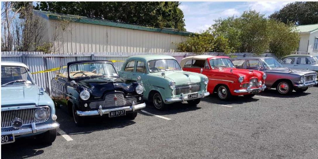
Carpark looking a bit flash with the Classic Car Club visiting for lunch